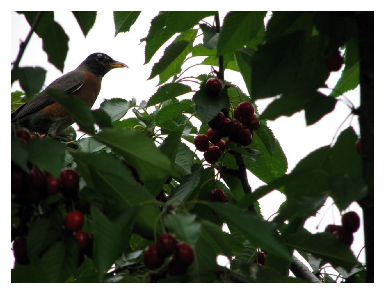
No worries though, within a day or two those cherries will be perfect and we'll have a big pickin' party.