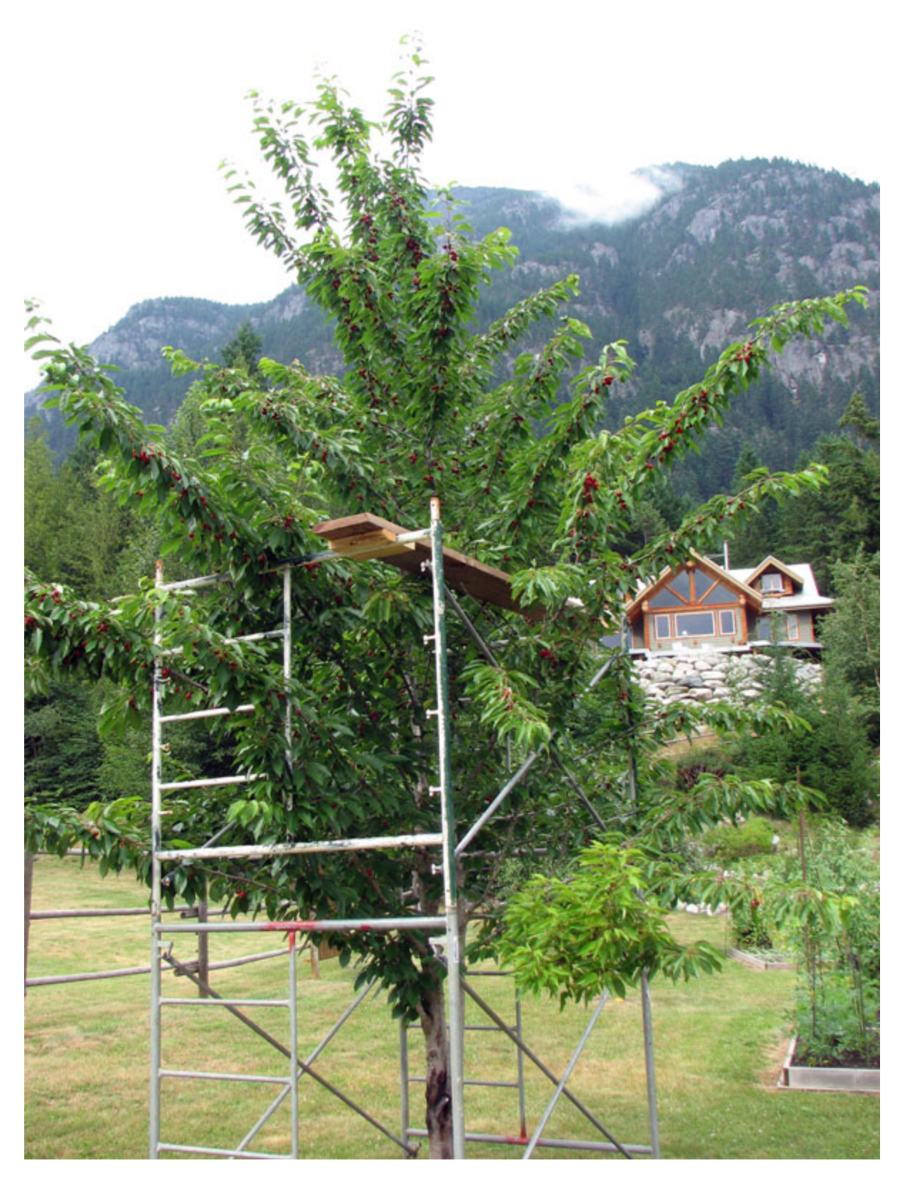
This guy kept the robins guessing for a while, long enough for the fruit to almost ripen: