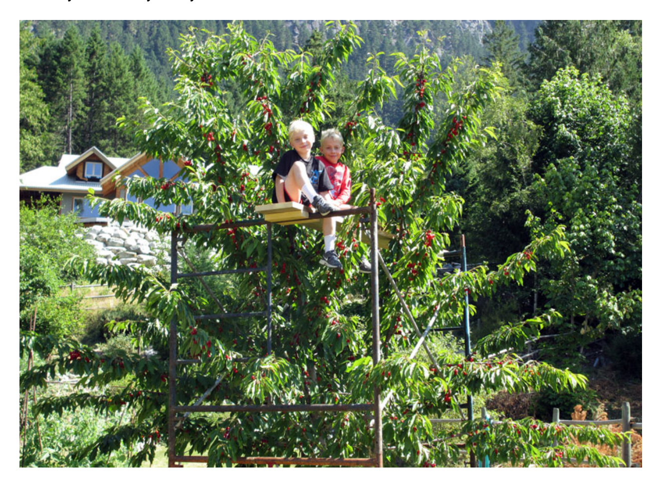
We've got two trees, the guys are in the "Stella" and this is the "Bing":

It works great, plus there is very little persuasion needed to get the guys to help me. It's sort of like monkey bars and yummy snack time combined: